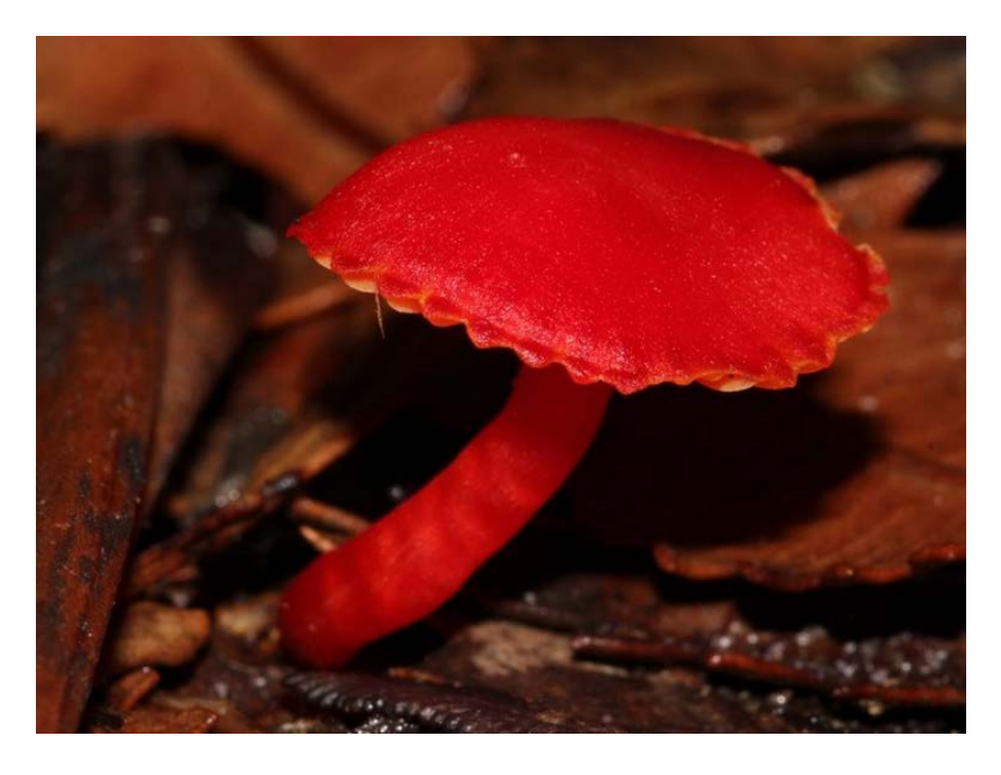
Hygrocybe sp.

If this spectacular array of fungal images does not send you out to look for fungi, then nothing will. Remember – best to look, photograph but not eat !!