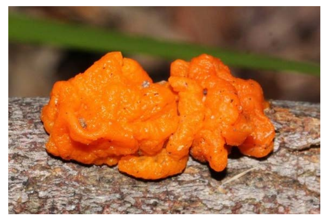
Tremella mesenterica