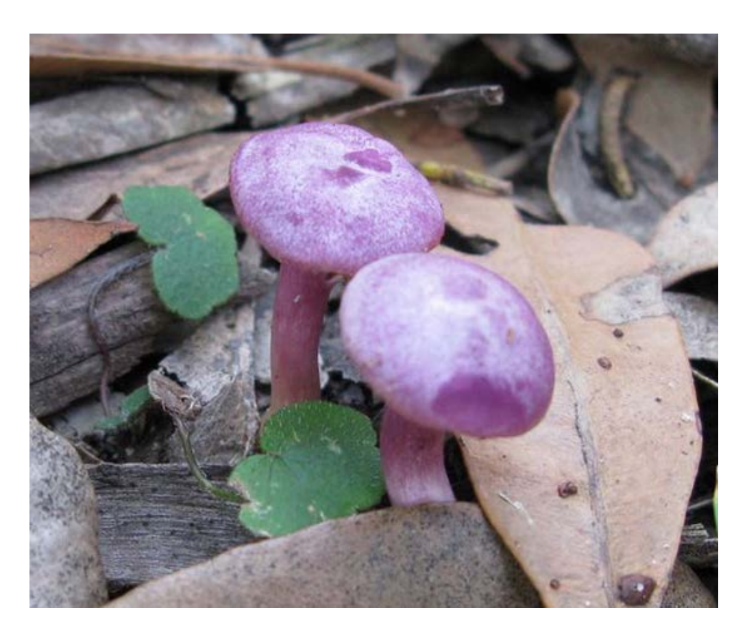
Hygrocybe cheelii - Photo by Joy Williams