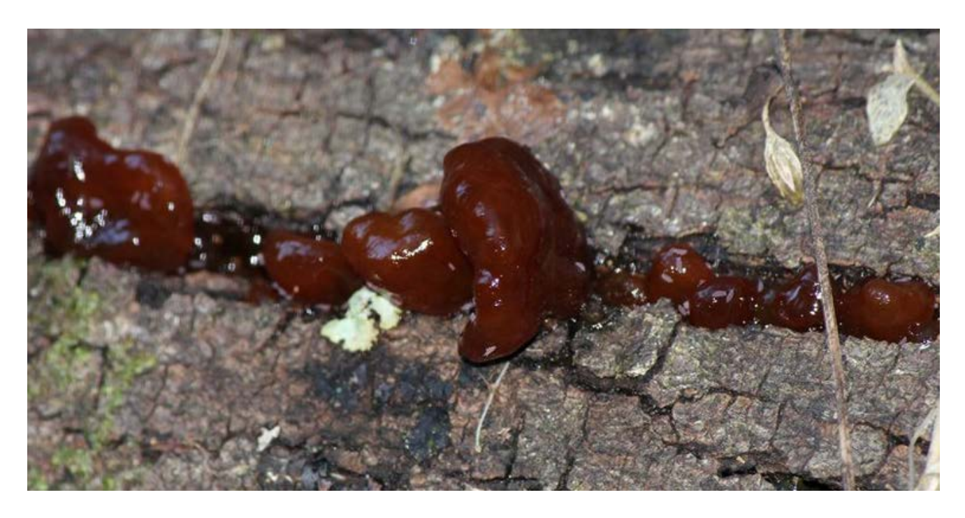
Tremella fimbriata