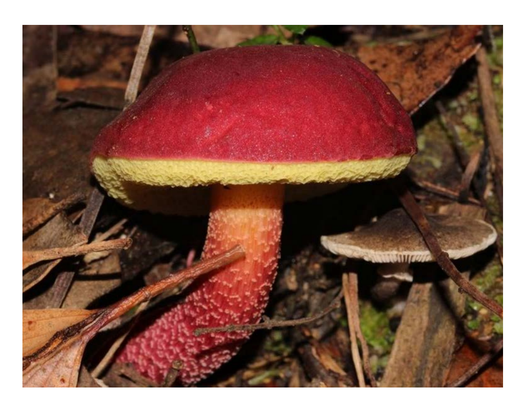
Bolete sp.