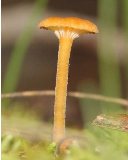
Rickenella fibula