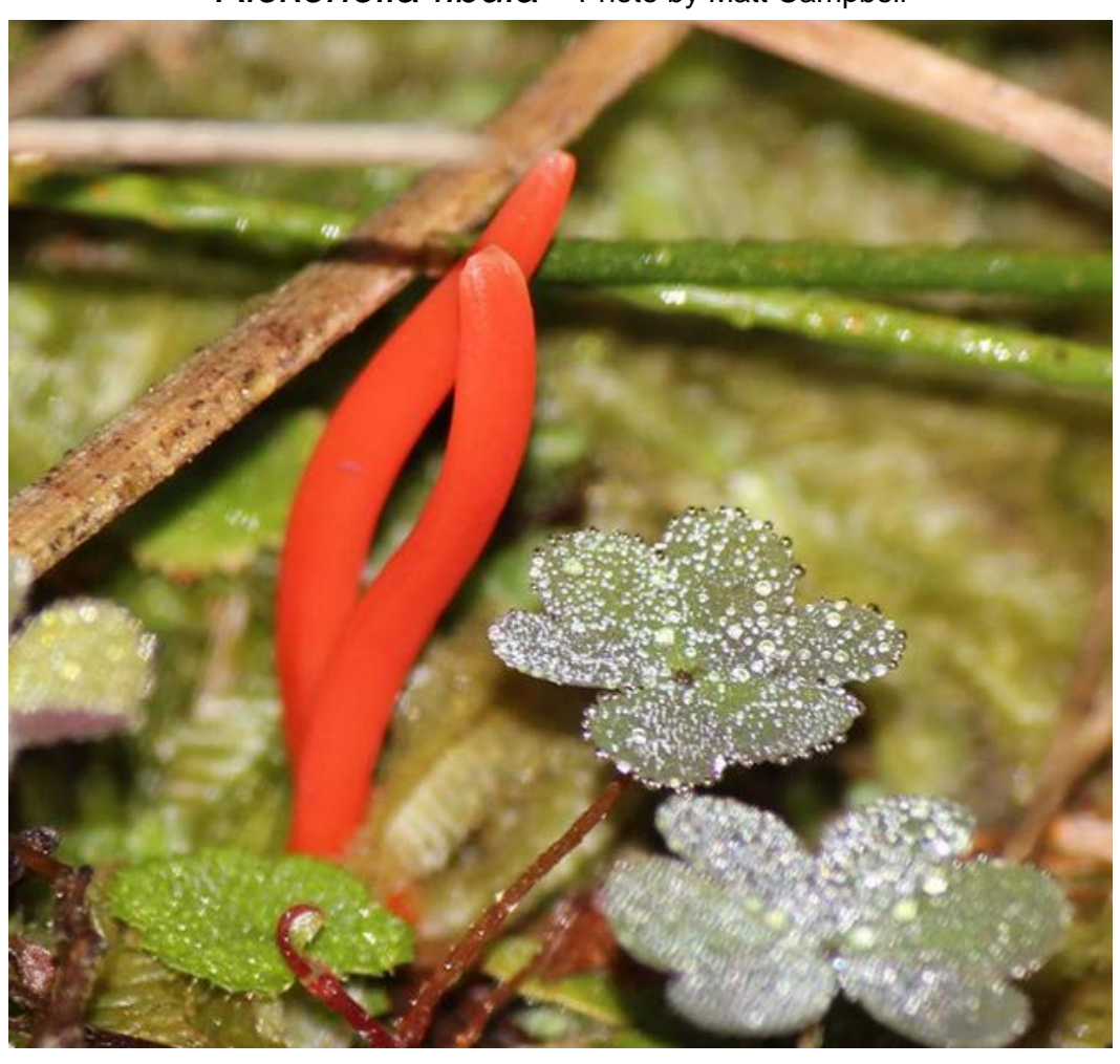
Clavaria miniata