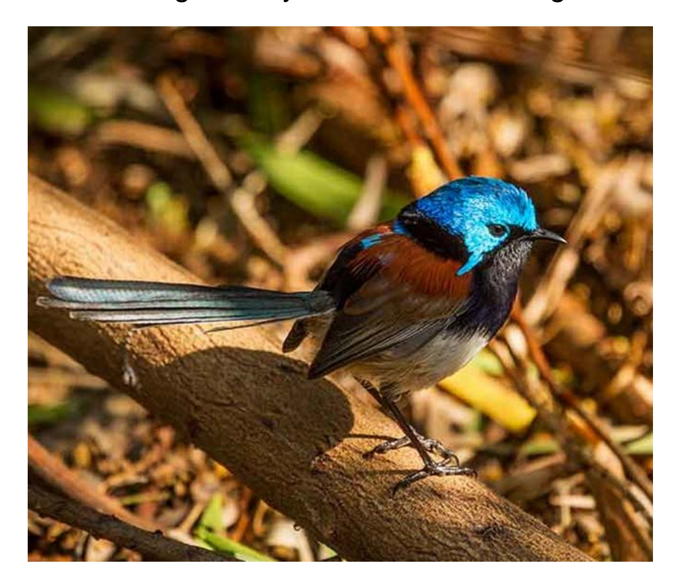
Variegated Fairy-wren - Malurus lamberti