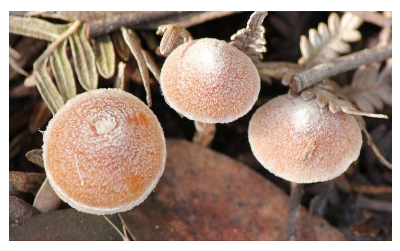
Inocybe austrofibrillosa