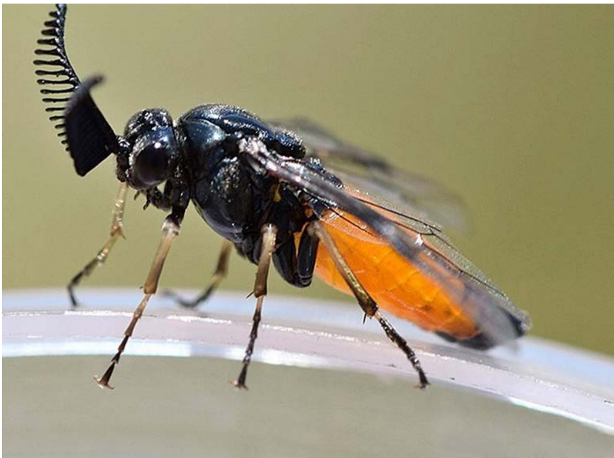
Location: Longford, Vic.

I identified the image from our 50 or so Museum specimens. But then I checked on ALA the distribution map for this species and I was surprised to see how little databased data there is for this species.