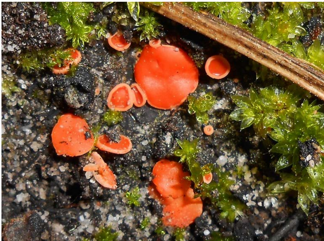
Location: Holey Plains State Park, Stradbroke VIC. Inermisia fuispora