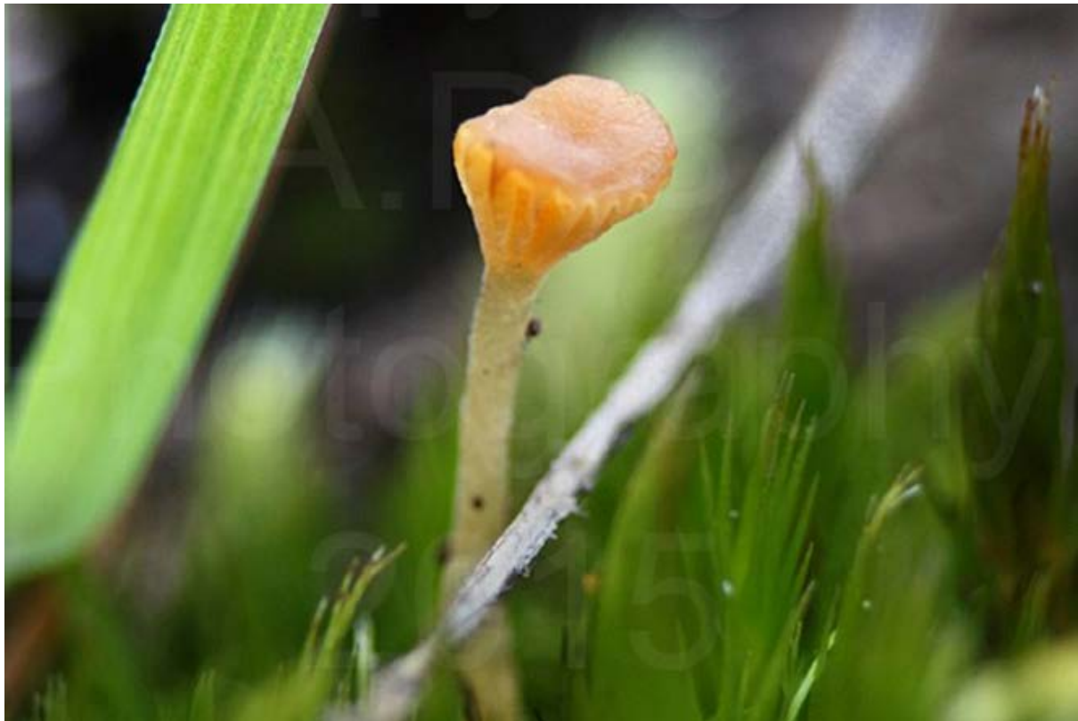
Location: Inglewood, Vic. Rickenella fibula