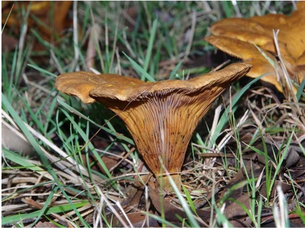
Location: Dromana Austropaxillus infundibuliformis