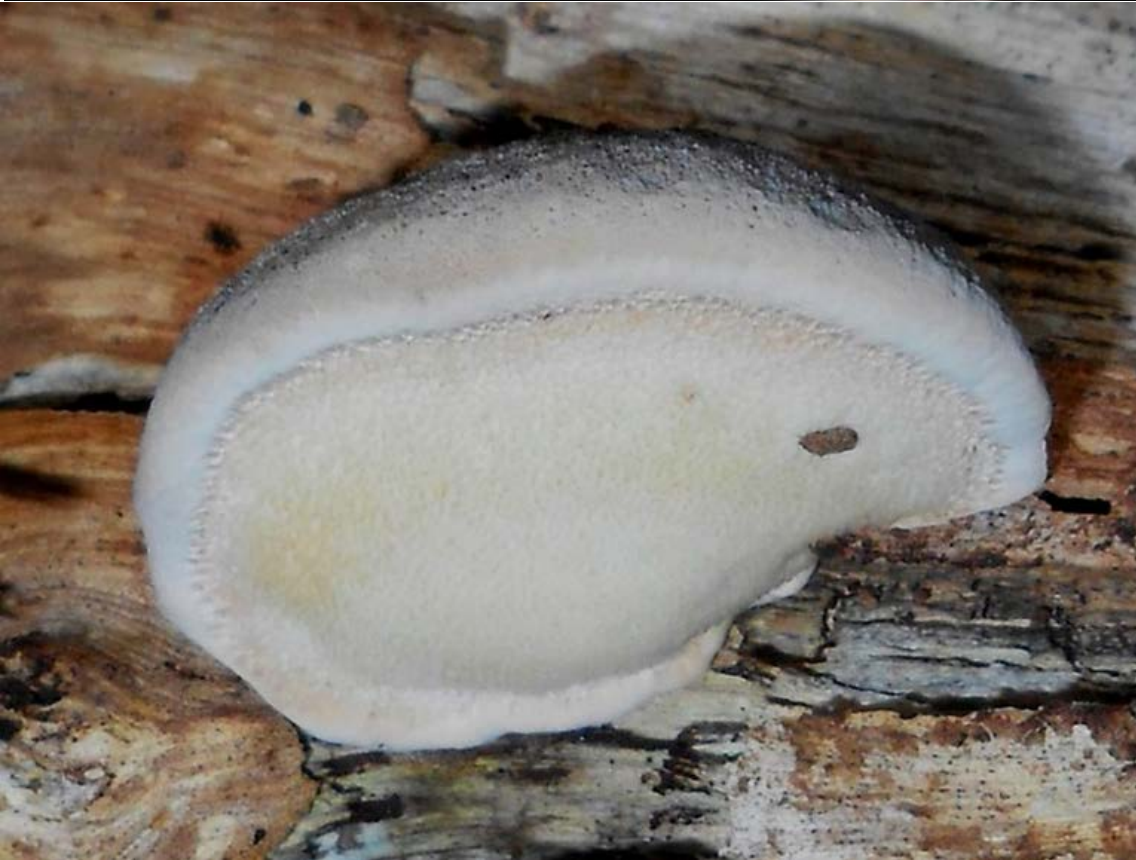
Above and below. Location: Stradbroke VIC. Postia pelliculosa