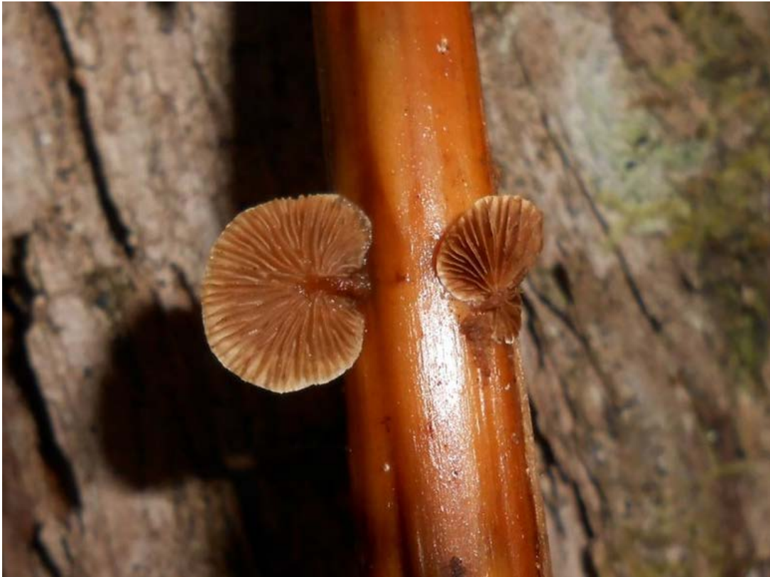
Location: Mt Baw Baw. Melanotus or Crepidotus ?