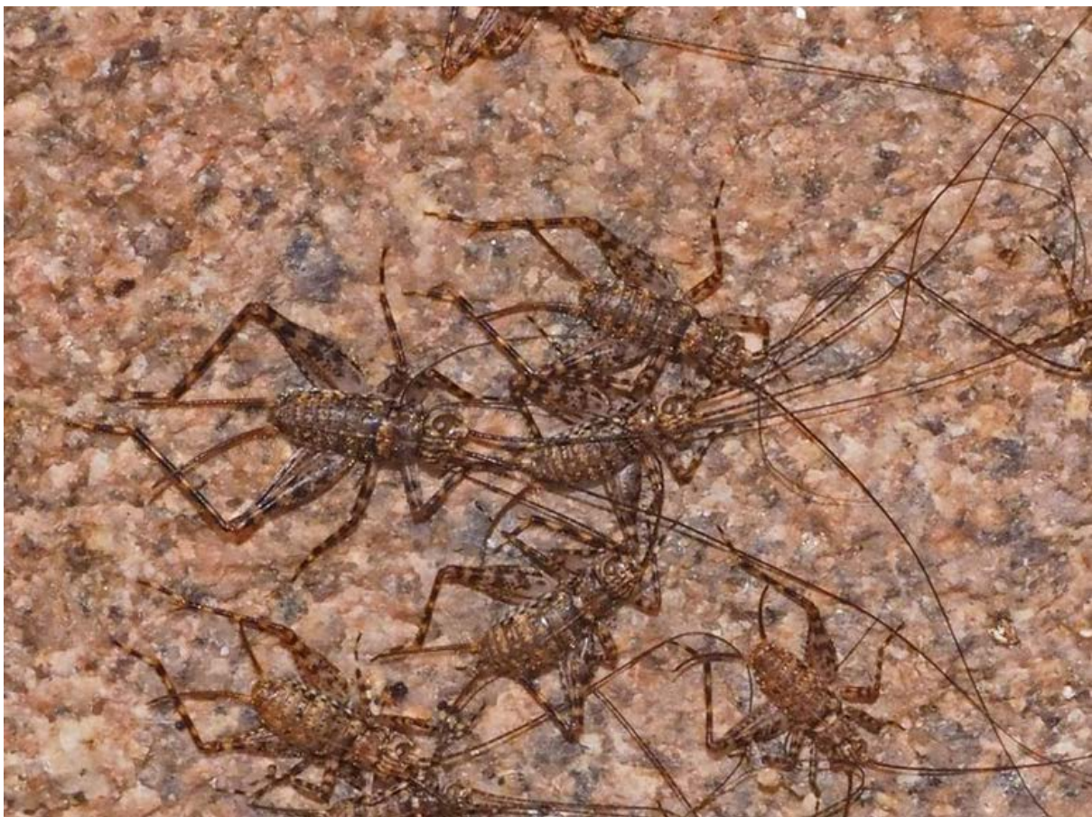
Location: Jibberding WA.

Apparently David is preparing a book on Australian crickets and he asked Linda to go back and try to photograph an adult cricket. The genus is: Orthoptera: Phalangopsidae: Endacusta .