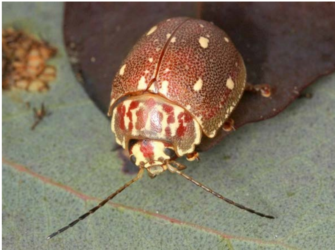
Paropsis geographica