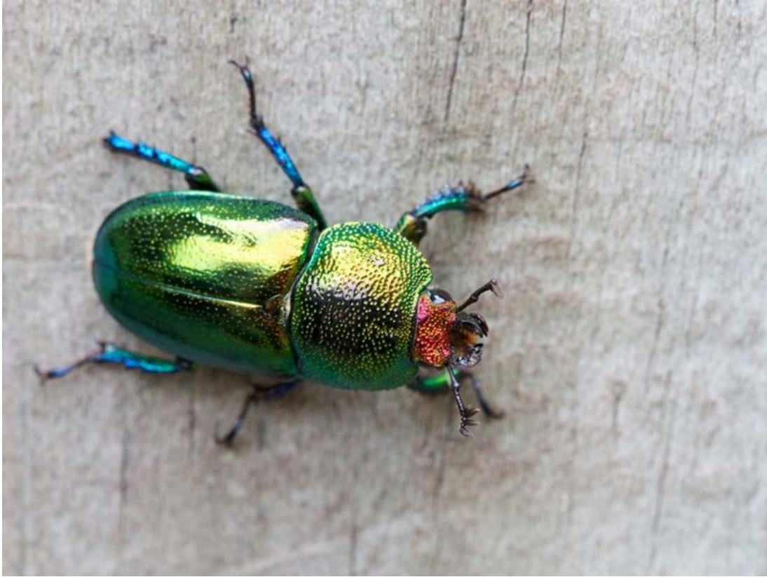
A female beetle – Note the small mandibles.